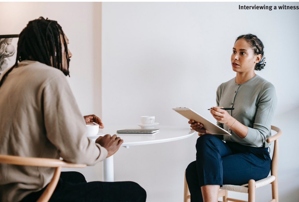
Interviewing a witness

help keep you on course and increase the chances that you will cover what you want to cover. Start by reviewing the issues involved in the case. For example, if it's a disciplinary case, take time to review the principles of just cause in the JCAM and Defenses to Discipline . If the case is about improper assignment of overtime, review the rules regarding overtime in the JCAM . The more you understand about Article 8, the better prepared you will be to know what information to seek and which witnesses to interview.