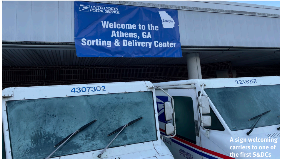
A sign welcoming carriers to one of the first S&DCs