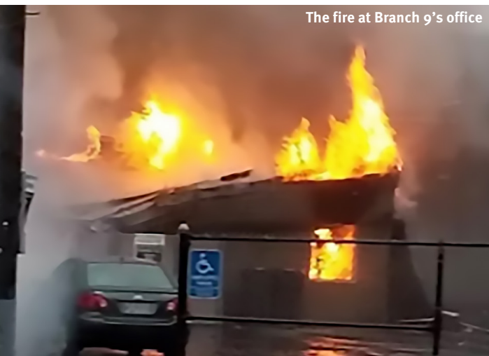
The fire at Branch 9's office

The record cycle and records management only works when it is a routine system or process that the branch continues. Remember the oath you made and your duty to upkeep it.