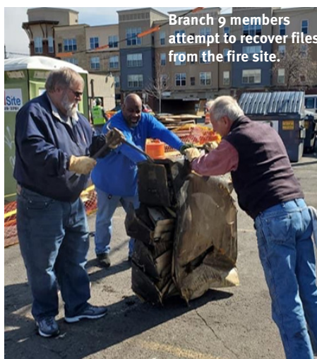
Branch 9 members attempt to recover files from the fire site.