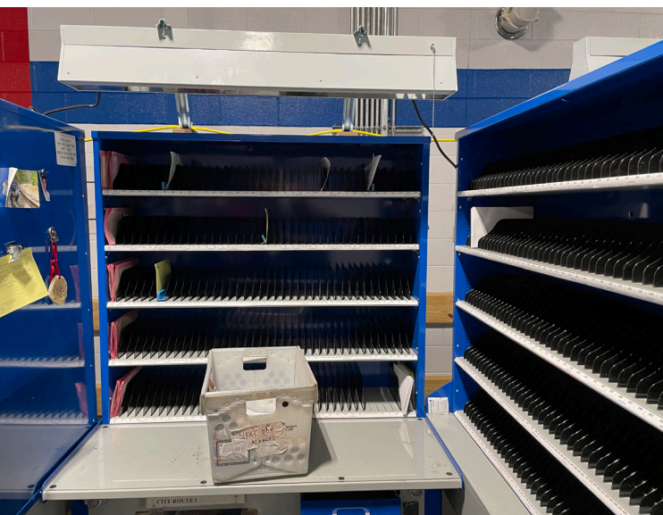
New letter carrier case at S&DC

at the national level will estimate the change in travel time for each route being relocated. This is done by looking at the travel time from the S&DC to the first delivery on the route and time it takes to drive from the last delivery to the S&DC. The parties do not evaluate the travel time within the route since the line of travel should not be changed solely due to an assignment being moved to an S&DC. This evaluation is then sent to the local parties, the branch president and postmaster,