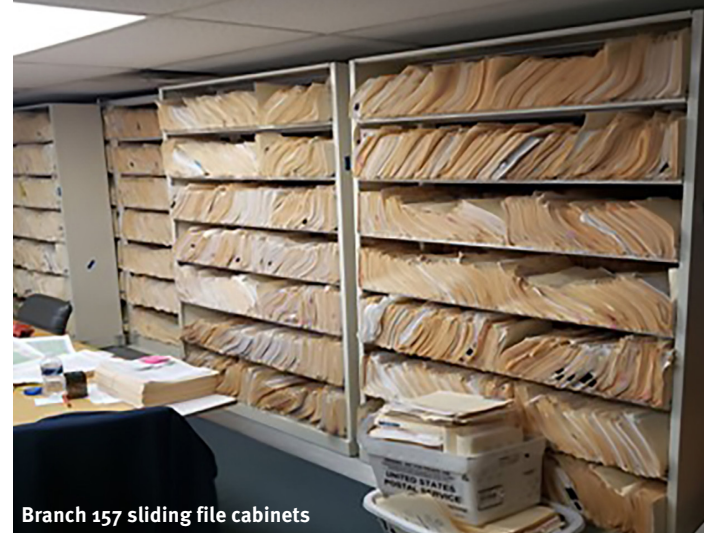
Branch 157 sliding file cabinets