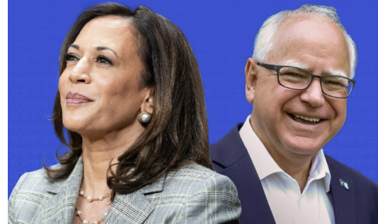
Kamala Harris and Tim Walz