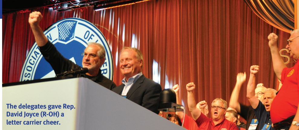
The delegates gave Rep. David Joyce (R-OH) a letter carrier cheer.

Br. 1100—third place; Massachusetts Northeast Merged Br. 25—second place; Eugene, OR Br. 916—first place.