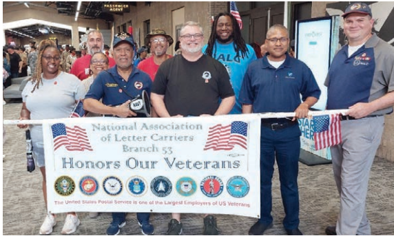
North Florida Branch 53 participates in the Veterans Day parade in Jacksonville.