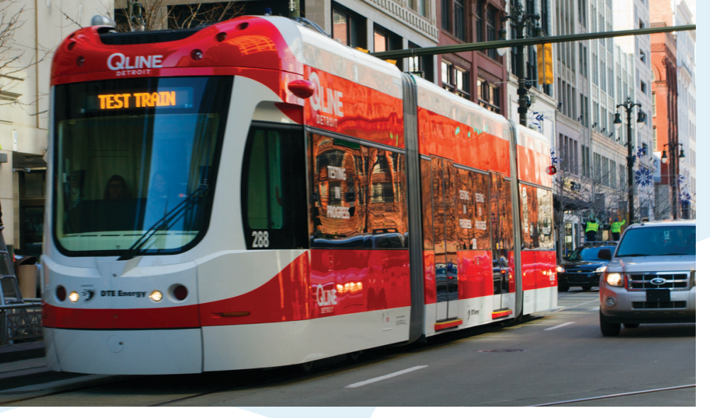
The new QLine streetcar system

As Detroit's tax base collapsed and it struggled to function, the state of Michigan moved to seize financial control of the city, but the effort failed. In 2013, Detroit filed the largest municipal bankruptcy in U.S. history—defaulting on $18.5 billion of debt, 400 percent higher than the previous record.