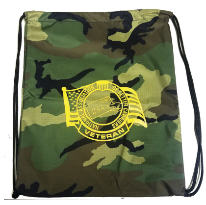
Volunteers will stuff bags of homeless care kits for veterans in need in Detroit.

Among the homeless are several generations of veterans whose service spans many of the various wars and conflicts, including World War II, the Korean War, the Cold War, the Vietnam War, Grenada, Panama, Lebanon, Operation Enduring Freedom (Afghanistan) and Operation Iraqi Freedom.