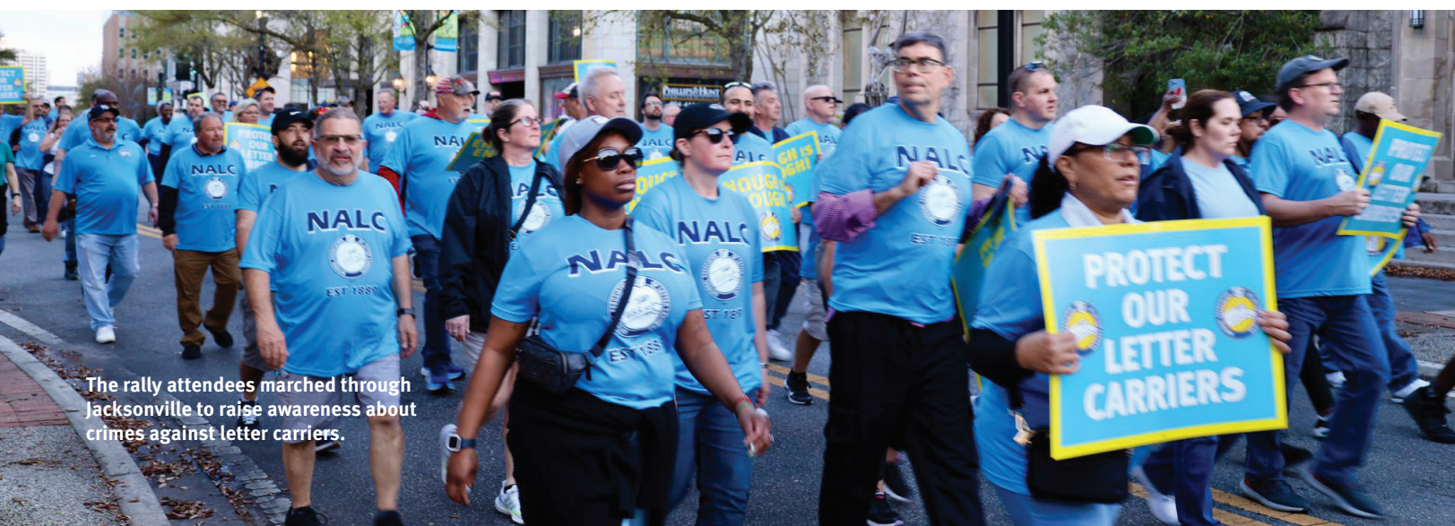
The rally attendees marched through Jacksonville to raise awareness about crimes against letter carriers.

"Events like these make a difference and bring awareness to this growing problem," he said. "I encourage all NALC branches, especially in areas that are experiencing an uptick in crime, to mobilize and plan similar events. When we all come out with a unified message, we are heard."