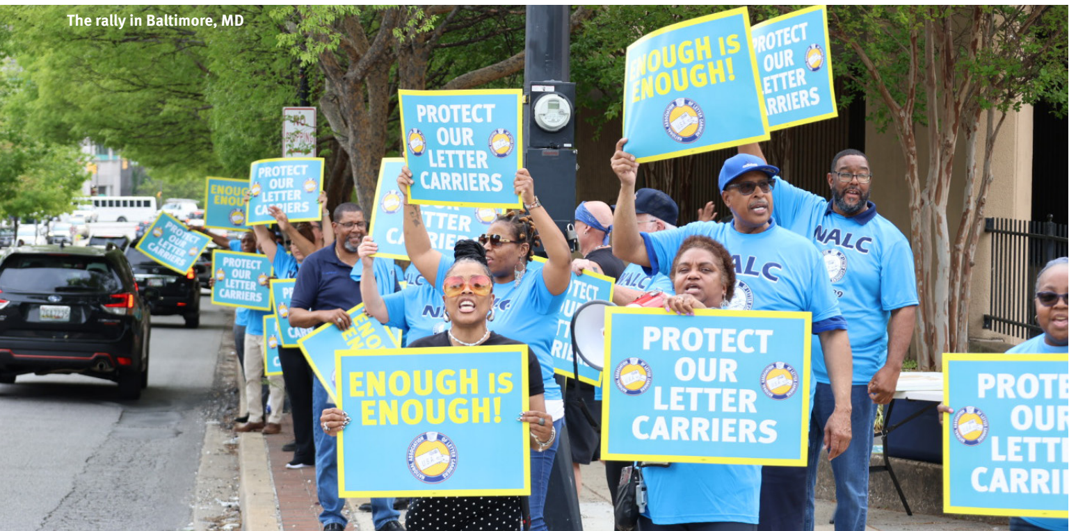
The rally in Baltimore, MD