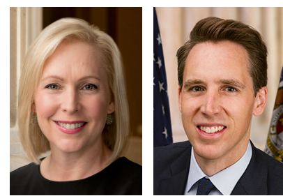
Sen. Kirsten Gillibrand (D-NY) Sen. Josh Hawley (R-MO)