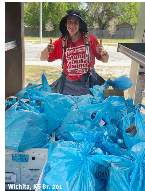
Wichita, KS Br. 201

Branches were asked to report their food drive totals to Headquarters by June 7.