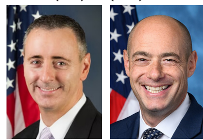
Rep. Brian Fitzpatrick (R-PA) Rep. Greg Landsman (D-OH)

On May 16, Sens. Kirsten Gillibrand (D-NY) and Josh Hawley (R-MO) introduced the Protect Our Letter Carriers Act (S. 4356) in the Senate, mirroring H.R. 7629.