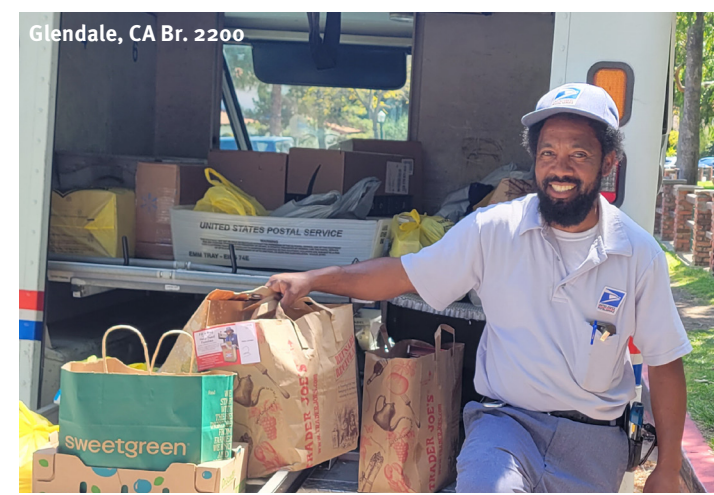
Glendale, CA Br. 2200