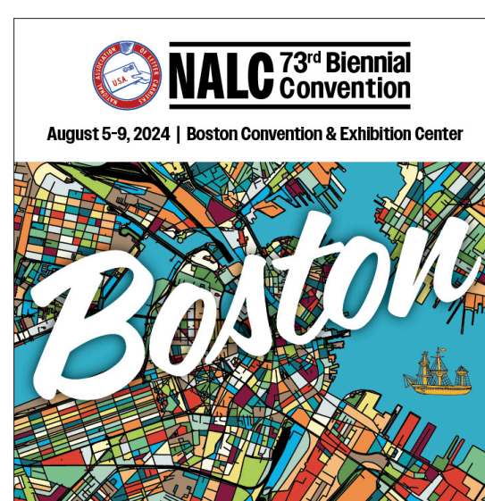
August 5-9, 2024 | Boston Convention & Exhibition Center

Go to nalc.org/convention for more convention news.