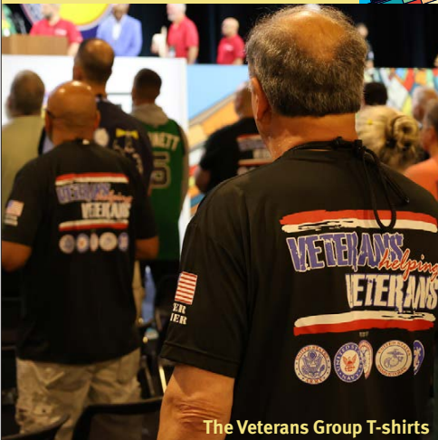
The Veterans Group T-shirts

to be split between the families of six letter carriers. The delegates approved the allocations.