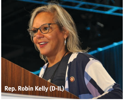
Rep. Robin Kelly (D-IL)

"I am confident that this won't be our last cause for celebration," she continued. "There is still more work to do to protect the vital services of the USPS. We should continue innovating how we use the USPS network to provide delivery services, expand partnerships and do everything we can to keep our letter carriers' workload manageable."