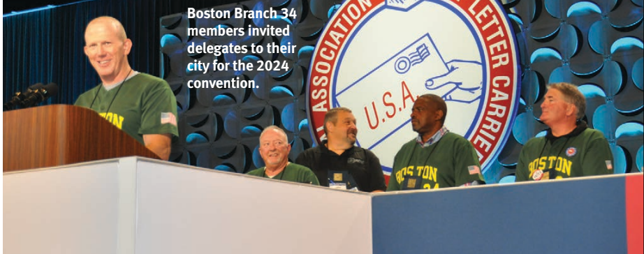
Boston Branch 34 members invited delegates to their city for the 2024 convention.