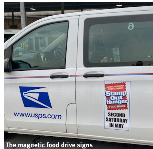
The magnetic food drive signs

Letter carriers who have questions about the food drive should contact their local branch coordinator. Regional and state food drive coordinators are available to assist; a contact list can be found on the Food Drive Tool Kit page at nalc.org/food under the heading "Important information for coordinators." More information about the Stamp Out Hunger Food Drive can be found online at nalc.org/food .