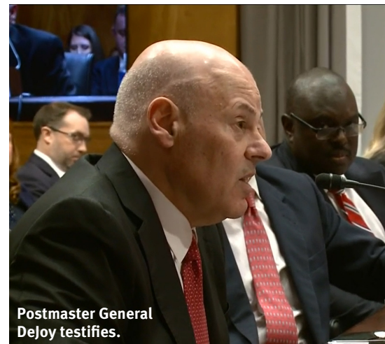
Postmaster General DeJoy testifies.

The hearing concluded with Chairman Peters saying he remains "laser-focused" on service. He emphasized the need for transparency and requested a list of locations the Postal Service plans to change with specific timelines for implementation, full-service data on every location implemented so far, and documentation for any cost projections from Postmaster General DeJoy by May 1. The two did not reach an agreement on that.