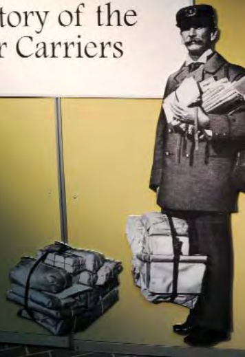
Above: A panel from the exhibit at Wayne State University's Reuther Library.