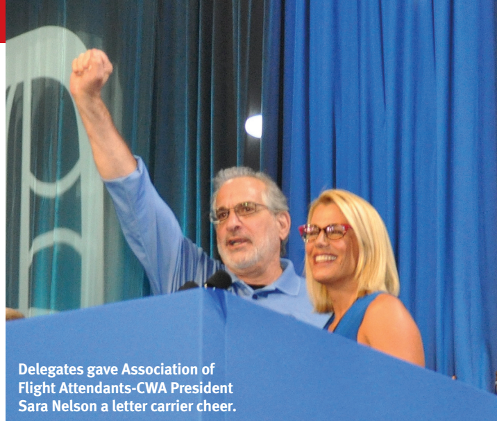
Delegates gave Association of Flight Attendants-CWA President Sara Nelson a letter carrier cheer.

Contrasting the Trump administration's claimed goal of building trust in government with the Postal Service's high public trust rating in surveys,