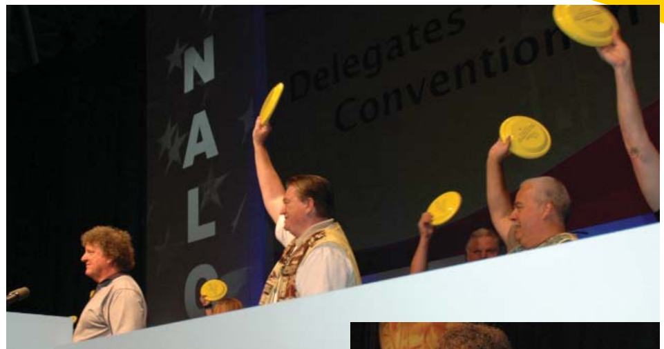
Above: Delegates from Garden Grove, California Branch 1100 take the stage to encourage members to attend the 67th convention, to be held in Anaheim in 2010.