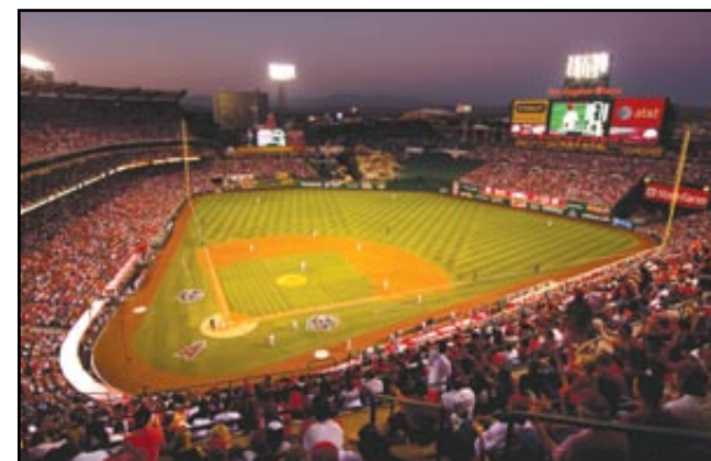
Angels Stadium in Anaheim, California, will be the site of the NALC Convention Baseball Night August 10 for the game between the Los Angeles Angels and the Kansas City Royals.

NALC branches throughout the country are ordering reserved tickets at a fast pace for a special Baseball Night during the 67th NALC National Convention in Anaheim, California, this August. As the NALC Bulletin went to press, 1,287 tickets had already been ordered and paid for, with additional orders arriving daily at NALC Headquarters.