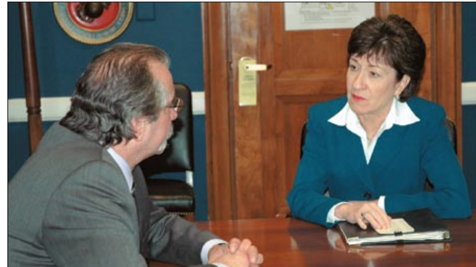
President Rolando meets October 15 with Sen. Susan Collins (R-ME), the ranking Republican member of the Senate Homeland Security and Governmental Affairs Committee which has jurisdiction over U.S. Postal Service matters. The NALC president and Collins discussed what legislation is needed to preserve the financial stability of the U.S. Postal Service and its letter carriers.