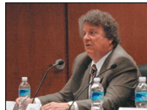
President Young testifies July 10 before Postal Regulatory Commission on universal service.

As a requirement of the Postal Accountability and Enhancement Act of 2006, the PRC is due to make a formal report to Congress by December 19 on universal postal service and USPS' monopoly on mail delivery and access to mailboxes.