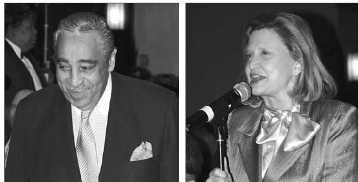
In left photo, Rep. Charles Rangel (D-NY), dean of the New York State congressional delegation, acknowledges applause when introduced at New York congressional breakfast. At right, Rep. Carolyn Maloney (D-NY) speaks to the delegation.

"I hope that you all are registered and active," Rangel said, "because what is going to happen in November is going to shake the whole world."